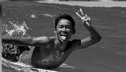
RIO WAIDA HIGHLITE ARCH EQYBS04648 - BGD0